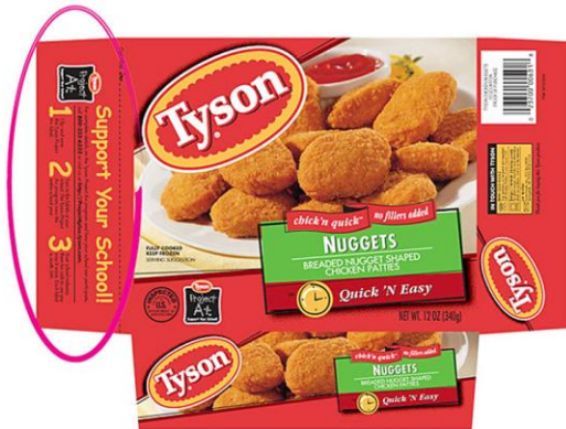
Tyson chicken boxes...