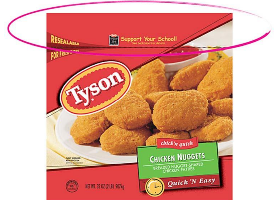
and Tyson chicken bags.

For more information on the Tyson Project A+ program, please contact Todd Costello at 330.722.3156, or check out the Tyson Project A+ Web site, http://ProjectAPlus.tyson.com .